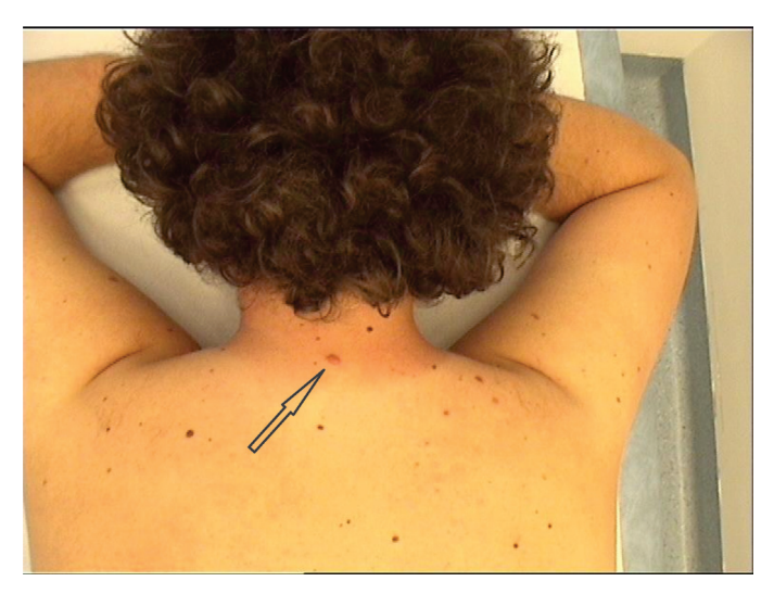
Figure 1 | Clinical presentation of the lesion: a solitary well-circumscribed reddish nodule in the lower vertebral line of the back of the neck.

and numerous intracellular amastigotes (Fig. 2, Fig. 3). Based on these findings, a diagnosis of cutaneous leishmaniosis was made.