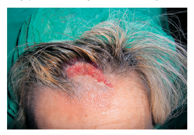
Figure 1. Ulceration of the scalp with elevated edges induced by oil-based paints.

order to detect behavior disorders. Skin biopsy should be performed in suspicious lesions. Our case is unusual due to its atypical location, but the histologic findings were decisive for making the correct diagnosis and treatment. Dermatologists should be aware that in cases of such lesions an underlying psychiatric disorder may be present.