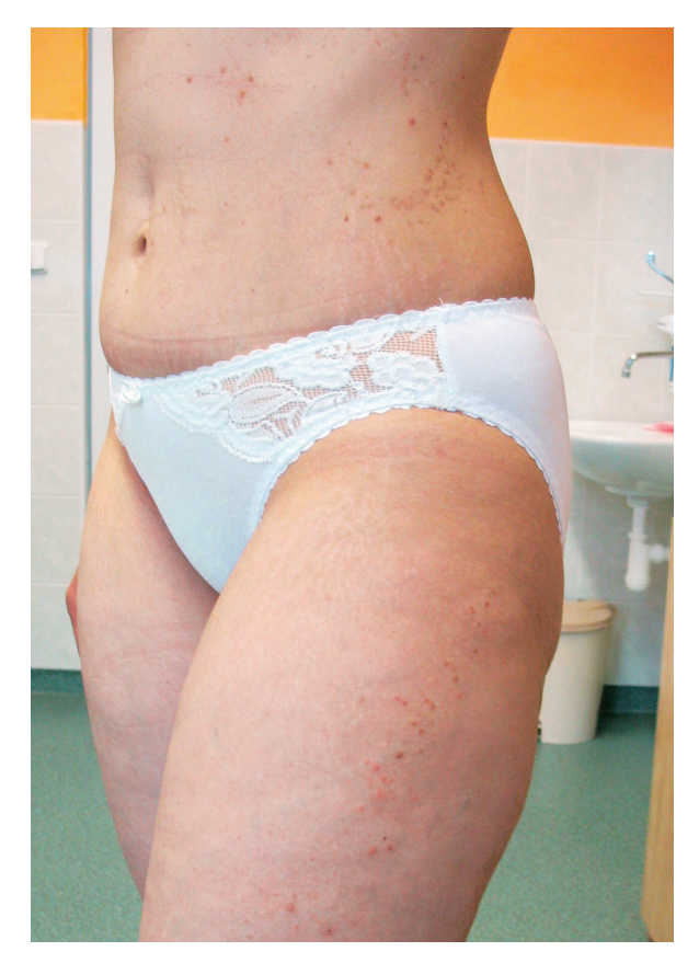
Figure 1. Hyperkeratotic and hyperpigmented papular lesions in a Blaschkoid pattern on the left abdomen and on the lateral aspect of the left thigh.