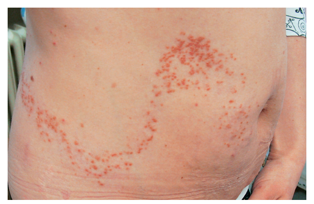
Figure 2a. Bizarre configuration of grouped hyperpigmented papules on the right abdomen.