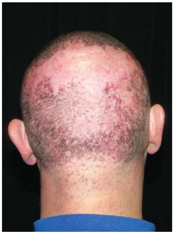
Figure 2. The same patient during triple combination therapy with isotretinoin, clindamycin, and prednisolone with marked improvement after 3 weeks.

During the 6 month follow-up no increase in cholesterol or triglyceride levels was observed. No relapse was observed during this time.