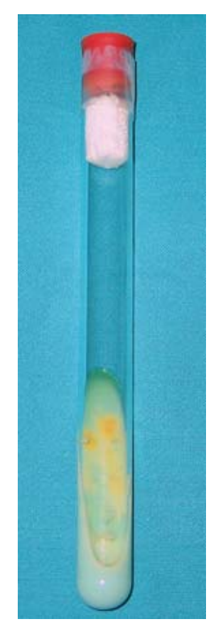
Figure 4. M.marinum cutaneous infection: Culture of Mycobacterium marinum on Löwenstein-Jensen medium.

Patients infected with M. marinum frequently have persistently positive tuberculin tests. Because of the high incidence of crossreactivity and low sensitivity, skin testing should not be considered as a diagnostic criterion for present or past infections with M. marinum. Evaluation for tuberculosis always should be performed in patients with positive tuberculin skin tests and treatment should be provided on the basis of current guidelines. However, positive tuberculin reactions in patients with M.