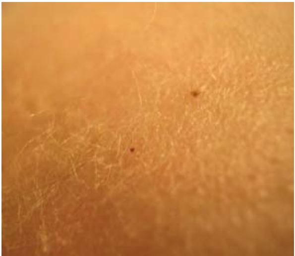
Figure 3. Abnormal, depigmented, short, sparse, and twisted hair in a patient with Menkes disease.

Copper is an essential trace element needed for the activity of many enzymes. The lack of copper leads to decreased activity of cytochrome C oxidase in the respiratory chain, which accounts for many neurological symptoms. The enzyme lysyl oxidase connects the collagen and elastin fibers, and reduced activity leads to fragility of connective tissue and blood vessels. The superoxide dismutase is an antioxidant enzyme in Purkinje cells. Its inactivity in MD results in profound loss of Purkinje cells. Tyrosinase is essential for melanin synthesis and its deficiency causes hair and skin hypopigmentation. The structural hair changes result from a defect in a copper-enzyme dependent cross-