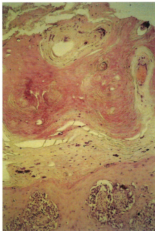
Figure 3. Both single and small nests of neoplastic melanocytes can be observed in the epidermal compartment. H&E 70x.

anti-PCNA (85%) and negative for Keratin (AE1/AE3).