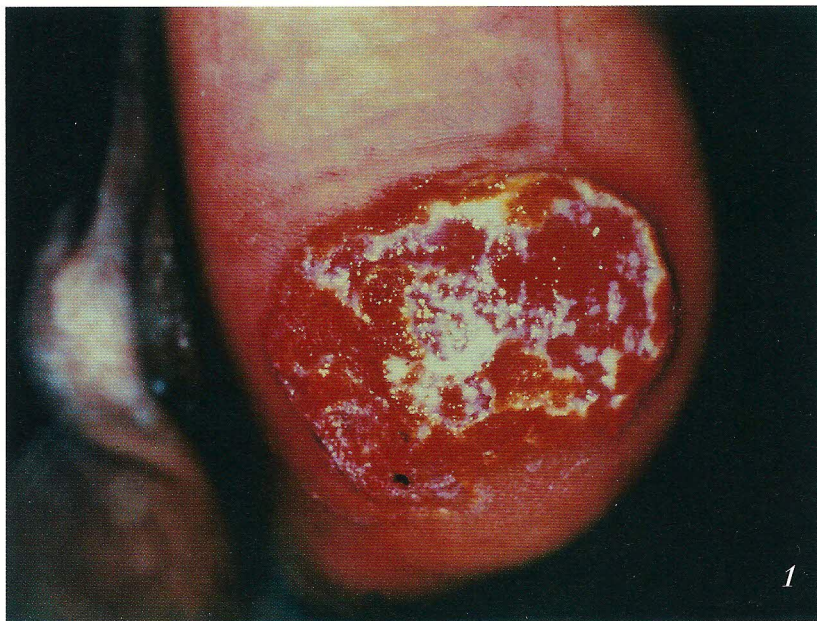
Figure 1. Ulcerative plaque of approximately 4 cm in its greatest diameter on the plantar surface of the right heel. The ulcerative lesion is deep red and with elevated borders. The surface was wet and spongy. Two pigmented spots, about 2 mm wide, could be observed within the lesional area.