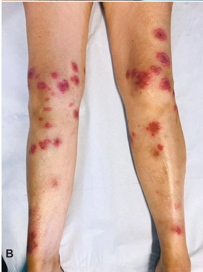
Figure 1 | Purple-erythematous infiltrating skin plaques with vesicular features located on the lower extremities.