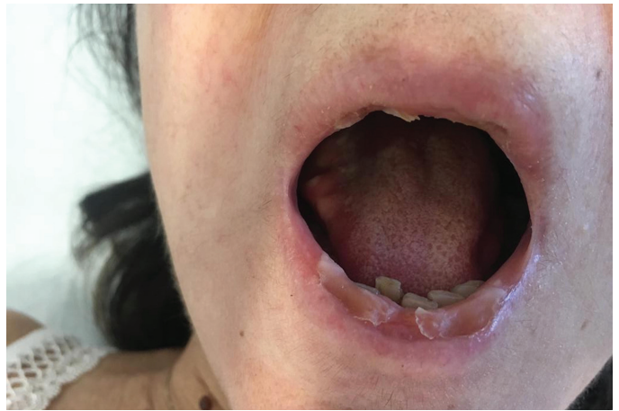
Figure 2 | Oral mucosa involvement characterized by ulcerative lesions on the lower lip.

In our case, anatomopathological examination of skin lesions supported the diagnosis of this rare variant of Sweet's syndrome, excluding the presence of pseudovesicular lesions due to edema. Sweet's syndrome occurs most frequently during periods of acute exacerbation of IBDs, but it may also precede bowel disease onset (3). Accordingly, it is reasonable not only to investigate an undiagnosed neoplasm at baseline, but also to monitor intestinal