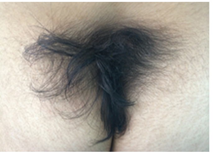
Figure 1 | A dense hypertrichotic area with coarse, thick hair was observed in the lumbosacral region.

tematomyelia, tethered cord, intraspinal lipomas, dermal sinuses, cutaneous aplasia, lipomeningomyelocele, and hemangiomas (4-7).