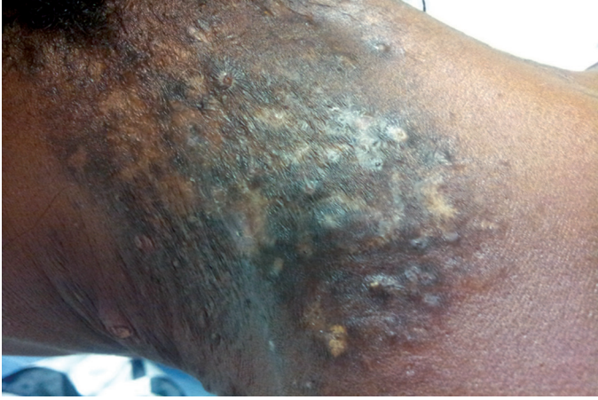
Figure 4 | After 2 months of therapy with intralesional injections of triamcinolone acetonide (40 mg/ml) every 15 days.

After 4 weeks of treatment, the disease was somewhat improved. After 8 weeks of therapy, physical examination revealed a moderate improvement of skin lesions and the patient reported a reduction in itching (Fig. 4).