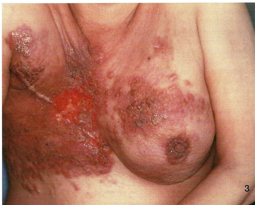
Figure 3. "En cuirasse" metastatic carcinoma appearing as an infiltrated, extensive plaque with papules and nodules on the anterior chest wall.

In all skin biopsy specimens, histopathologic features of adenocarcinoma with varying degrees of cell differentiation were observed. The most frequent histopathologic findings were single or multiple nodules located in the dermis and subcutaneous tissue, com-