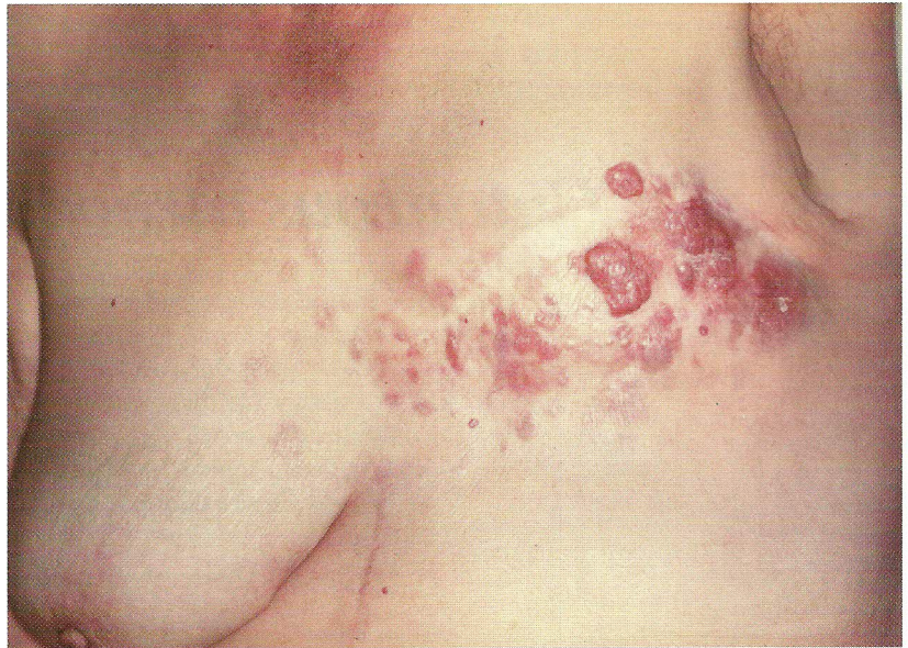
Figure 1. Multiple metastatic nodules at the site of mastectomy.

Metastatic cutaneous lesions were located at the site of mastectomy in 50 patients and elsewhere on the anterior aspect of the chest in 75, axilla (8), back (8), scalp (5), periauricular area (5), supraclavicular area (4), face (2), neck (2), upper (3) and lower (2) extremities. In all patients, appearance of cutaneous lesions followed the diagnosis of breast carcinoma (range: 2 months-8 years; mean: 4.1 years). Cutaneous lesions did not occur as a first sign of the disease in any of the patients examined. Clinical features included papules and/or nodules in 131 patients (80%), telangiectatic carcinoma in 19 (11.2%), erysipeloid carcinoma in 5 (3%), "en cuirasse" carcinoma in 5 (3%), alopecia neoplastica in 3