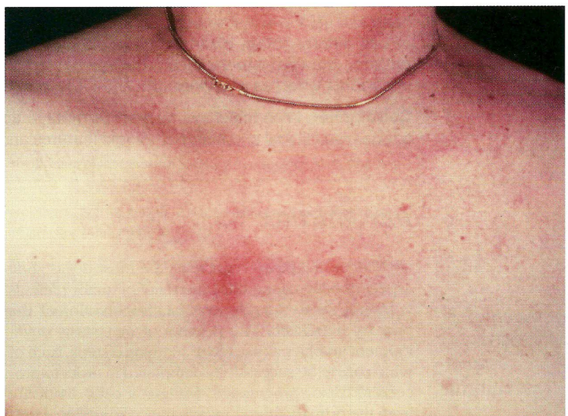
Figure 2. Erythematous nodule located on the chest wall.

(2%) and a zosteriform pattern in 1 (0.8%). Nodular carcinoma, which was the most frequent clinical presentation, appeared as cutaneous or subcutaneous, solitary or multiple, pink to reddish, firm, rarely ulcerated nodules. Lesions were mainly located over the chest wall although face, neck, upper and lower extremities were involved too (Fig. 1). Telangiectatic metastatic breast carcinoma was characterized by purpuric papules, nodules or plaques on the trunk usually located in continuity with the surgical scar (Fig. 2). Erysipeloides