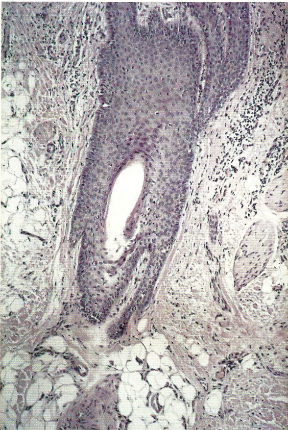
Figure 2. Mantle-like structures (H&E, 120x)

In vertical sections, an increased rate of catagen follicles may be present. The histological findings of psoriatic scarring alopecia show a complete absence of follicular units, replaced by fibrosis. The epidermis is thin and no inflammatory infiltrates are observed (8).