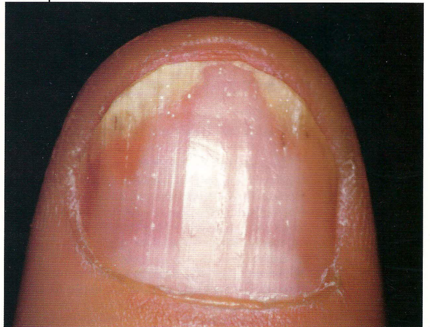
Figure 3. Nail psoriasis: pitting, onycholysis and oil red patches

Signs of nail psoriasis depend on the localization of the disease in the nail unit (9, 10). A number of nail abnormalities often occur simultaneously due to involvement of different nail constituents in the same patients (9). Psoriasis affects fingernails more frequently than toenails. Psoriasis of all 20 nails is rare. The clinical manifestations of fingernail psoriasis are, in order of frequency: pitting, reddish oil (salmon) patches, ony-