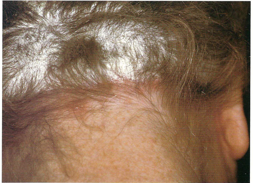
Figure 1. Scalp psoriasis