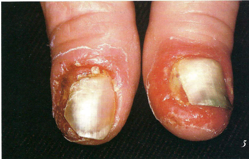
Figure 5. Pustular psoriasis.

Subungual hyperkeratosis describes the accumulation of parakeratotic cells under the distal portion of the nail plate and hyponychium. In fingernails, parakeratotic cells often lose their cohesion and are progressively eliminated resulting in the development of onycholysis. In toenails, hyperkeratosis is usually tightly adherent to the nail plate, which becomes hard, thick and lifted up. Nail abnormalities seen in psoriasis and onychomycosis may be indistinguishable since subungual hyperkeratosis, onycholysis and splinter haemorrhages are clinical signs of both these conditions. Dermatophytes or other fungi can colonize psoriatic nails. Therefore a positive culture does not rule out