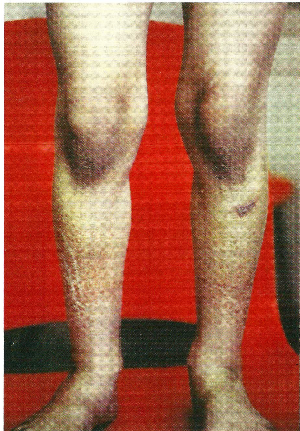
Figure 1. The entire skin is covered with grayish ichthyosiform scales, which are most intense on the extensor sites of the extremities.

son has the same changes, without epilepsy. The father's brother suffers from epilepsy.