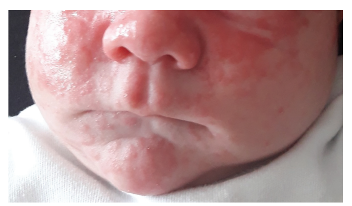
Figure 4 | Red papular exanthem of the baby's face.