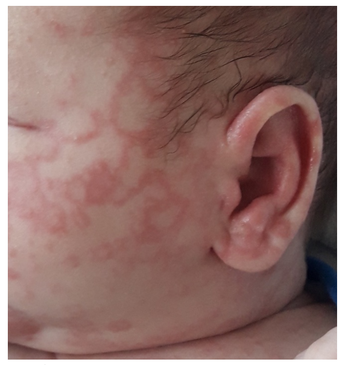
Figure 5 | Exanthem of the face with small pustules.

Our patient with erythroderma, intertriginous inflammation, and pustules on the trunk was admitted to the infectious diseases clinic, where blood cultures and skin smears were taken to exclude systemic infection and antibiotic treatment was started. After transferring the infant to our ward, a detailed clinical examination was made, which excluded systemic infection. Erythroderma persisted despite local corticosteroid treatment, and the skin smears showed colonization with multiple pathogenic bacteria.